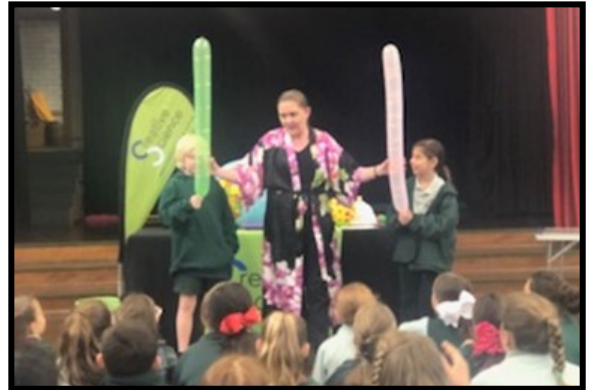
Figure 2 - Rocket Balloon Race - concept of jet propulsion