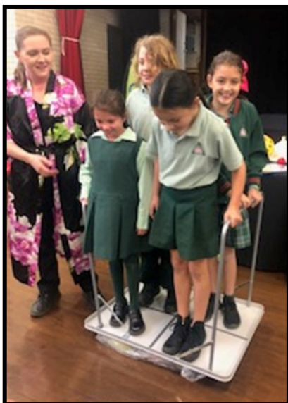
Figure 5 - Standing on Balloons - concept of gravity, spreading the weight force over a large area