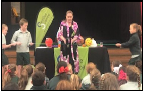
Figure 1 - Tug of War - science concepts of friction, lubrication, pulling force and tension

Stage 2 participated in a live science show about forces. This is linked to the outcomes we are studying in Science and Technology. It was very informative and entertaining. Some photos below illustrate the different experiments and concepts explored.