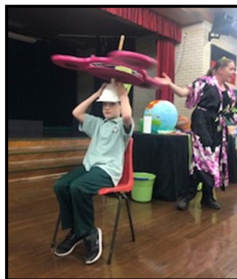
Figure 6 - Giant Fidget Spinner - concept of gravity, friction, rotational inertia