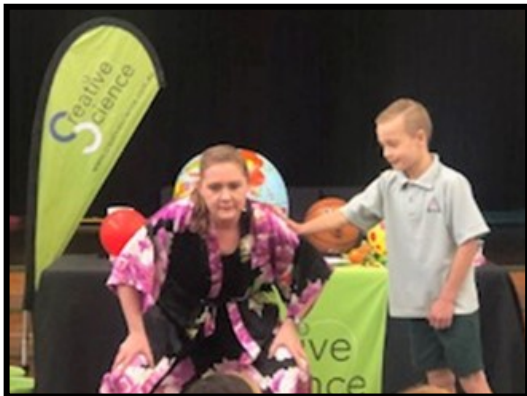
Figure 3 - Sumo Wrestler - concept of centre of gravity, support base, stability