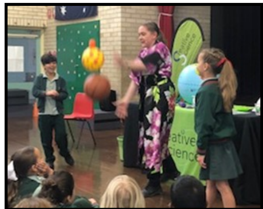
Figure 4 - Three Ball Bounce - concept of gravity and energy transfer