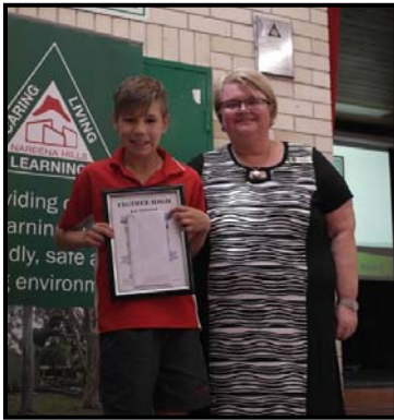
Figtree High School Scholarship