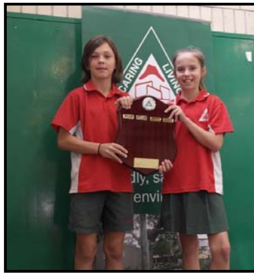
Winning House - Banksia