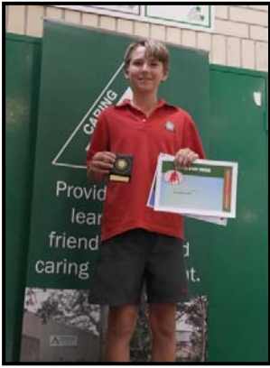
School Sports Person