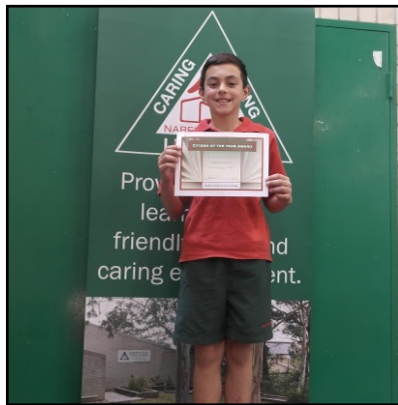
Citizen of the Year