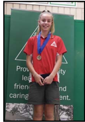
Premier Sporting Challenge