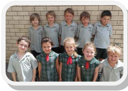
Early Stage 1

Last week the following students received their Awesome Badges.