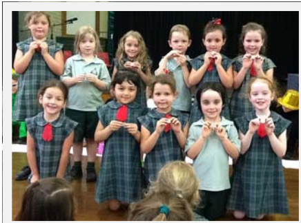
Early Stage 1

Last week the following students received their Awesome Badges.